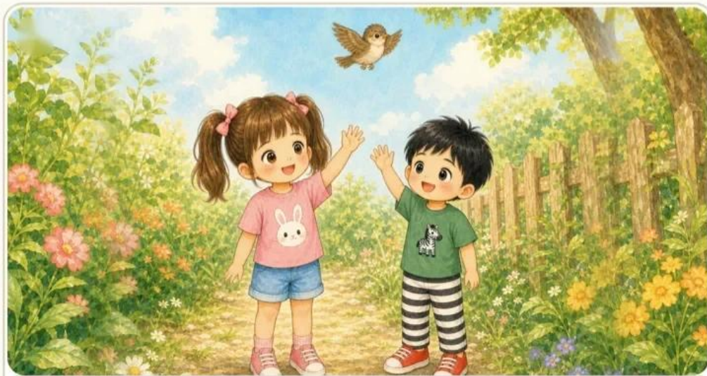
小鳥好了，開心地飛走了。 The bird is better and flies happily away.