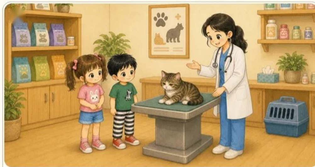
他們帶貓咪去看醫生。 They take the cat to see the doctor.