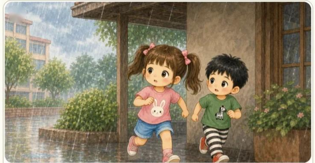
突然下雨了，他們躲在屋簷下。 Suddenly it rains, so they shelter under the eaves.