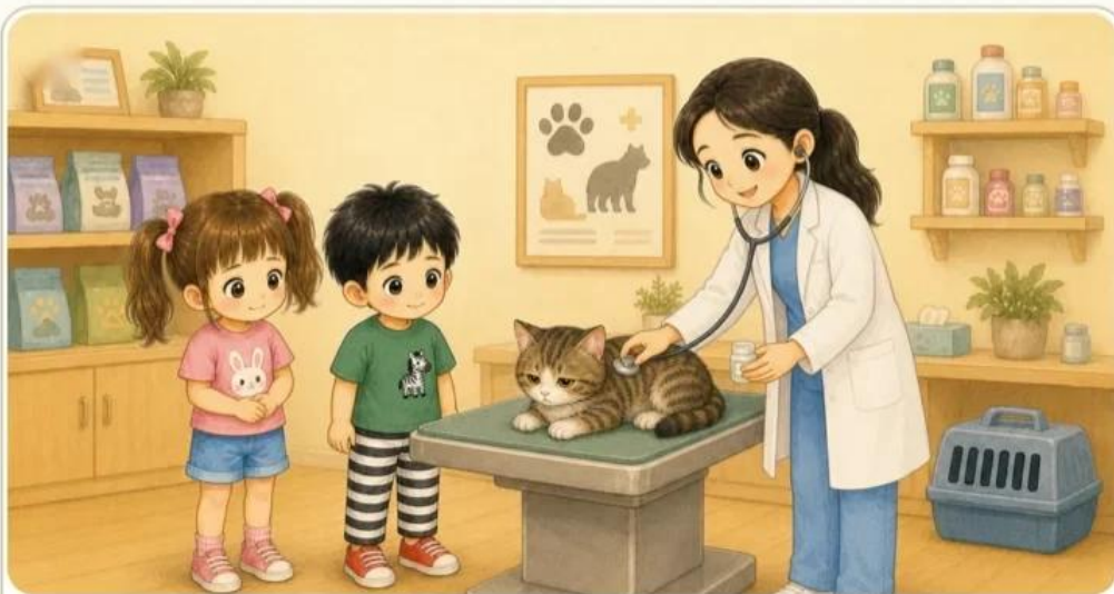
醫生幫貓咪看診、吃藥。 The doctor checks the cat and gives medicine.