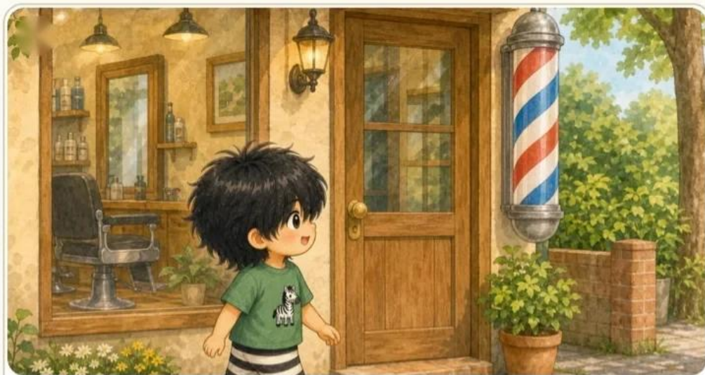
斑斑去理髮店。 Ban-Ban goes to the barber shop.