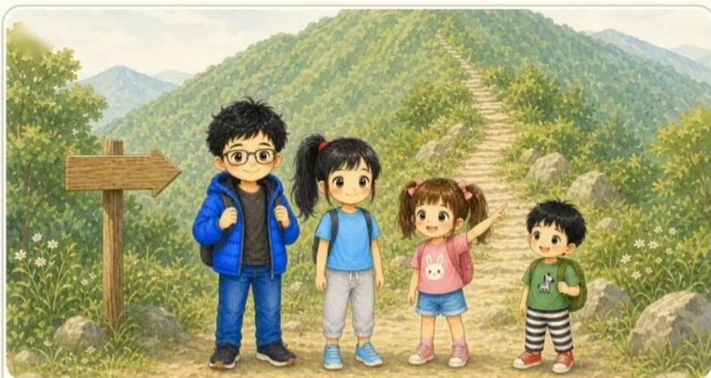
大家一起去爬山。 Everyone goes hiking together.