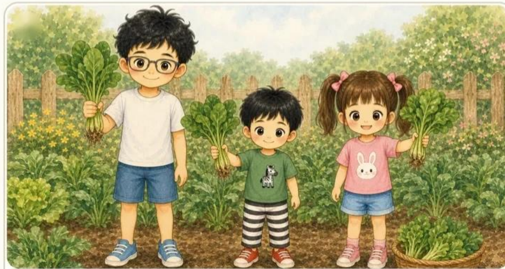
青菜長大了，一起收成！ The vegetables have grown — harvest time!