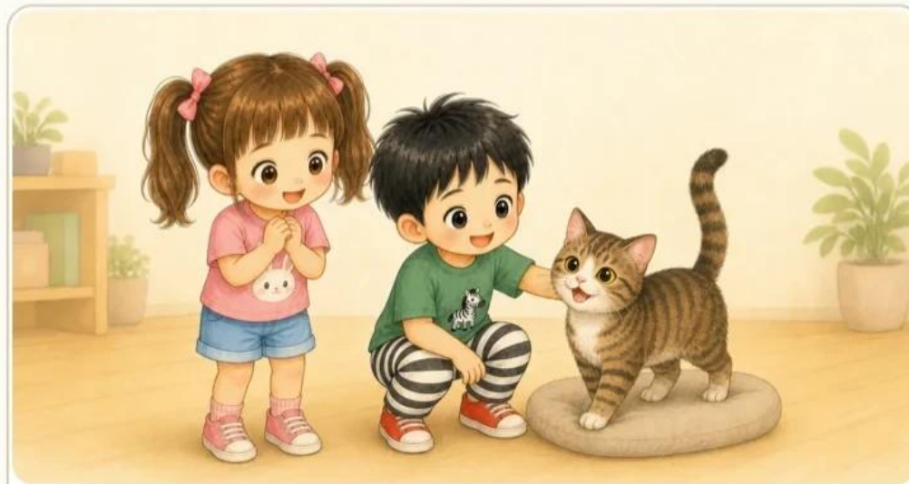
貓咪康復了，又有精神了！ The cat is well again and full of energy!