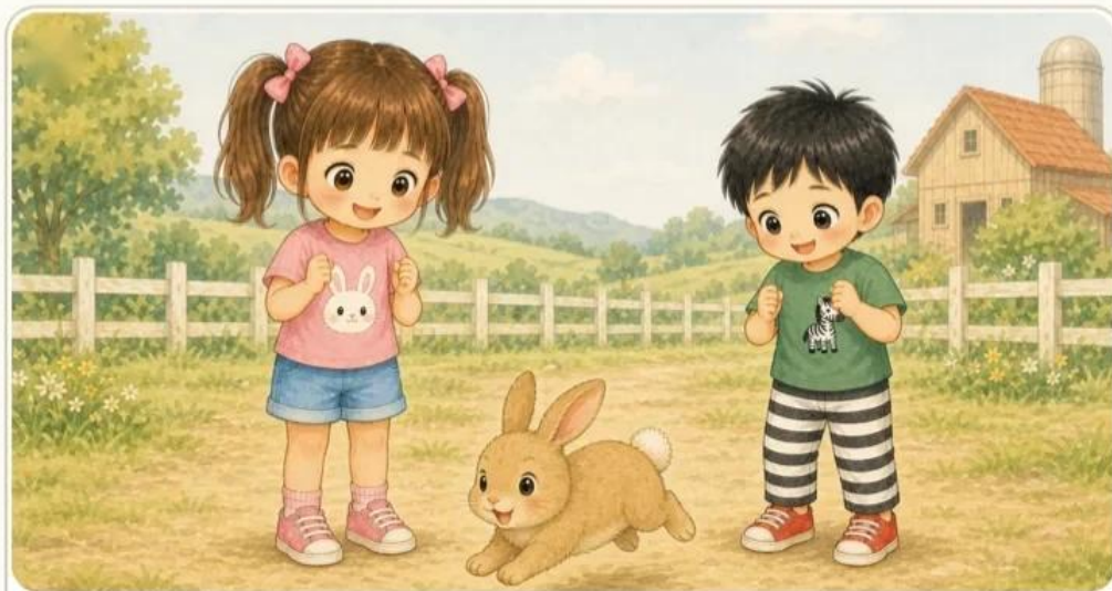
小兔子吃飽了，蹦蹦跳跳。 The rabbit is full and hops about happily.