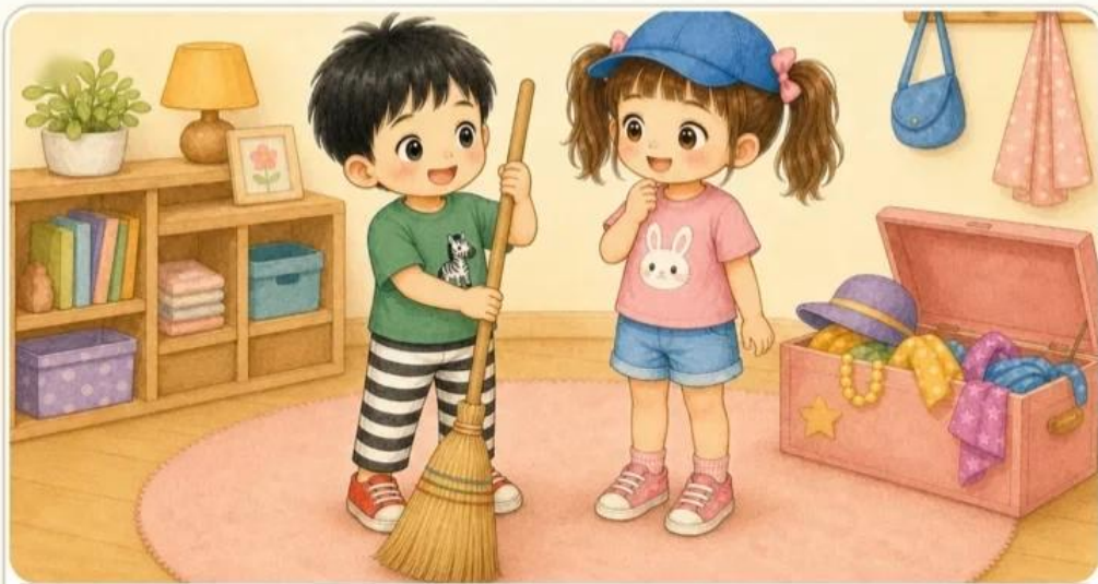
找到掃把了！ Found a broom!