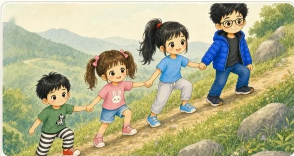
大家互相加油，牽手往上爬。 They cheer each other on and climb hand in hand.