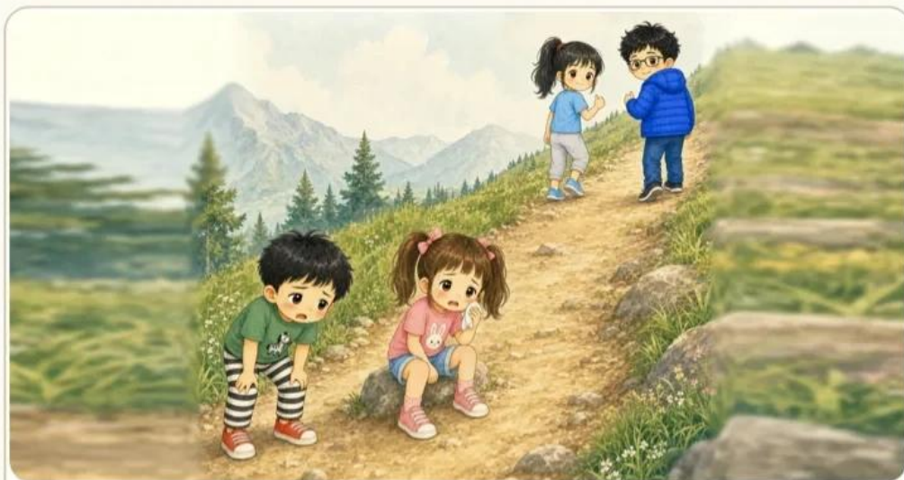
斑斑和兔兔覺得好累。 Ban-Ban and Tutu feel so tired.