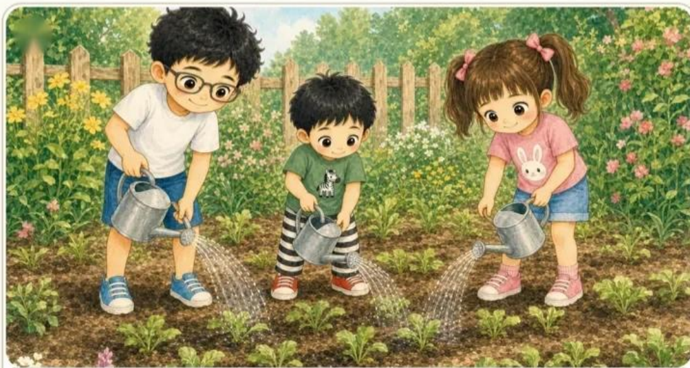
幫青菜澆水，長出小芽。 They water the garden and little sprouts appear.