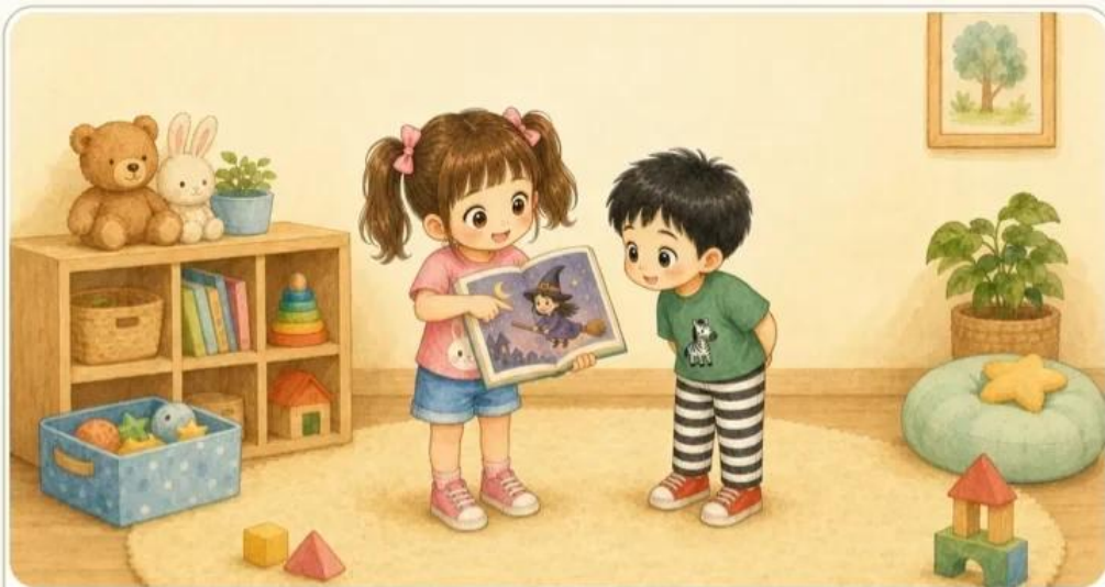
兔兔看故事書，想當小女巫。 Tutu reads a story and wants to be a little witch.