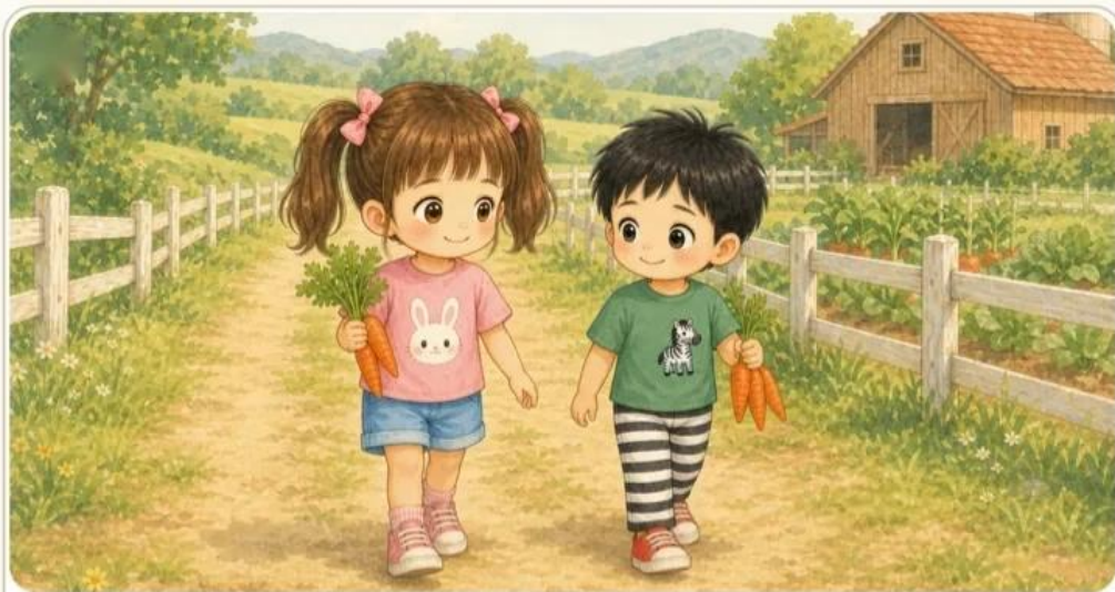
斑斑和兔兔帶紅蘿蔔去農場。 Ban-Ban and Tutu bring carrots to the farm.