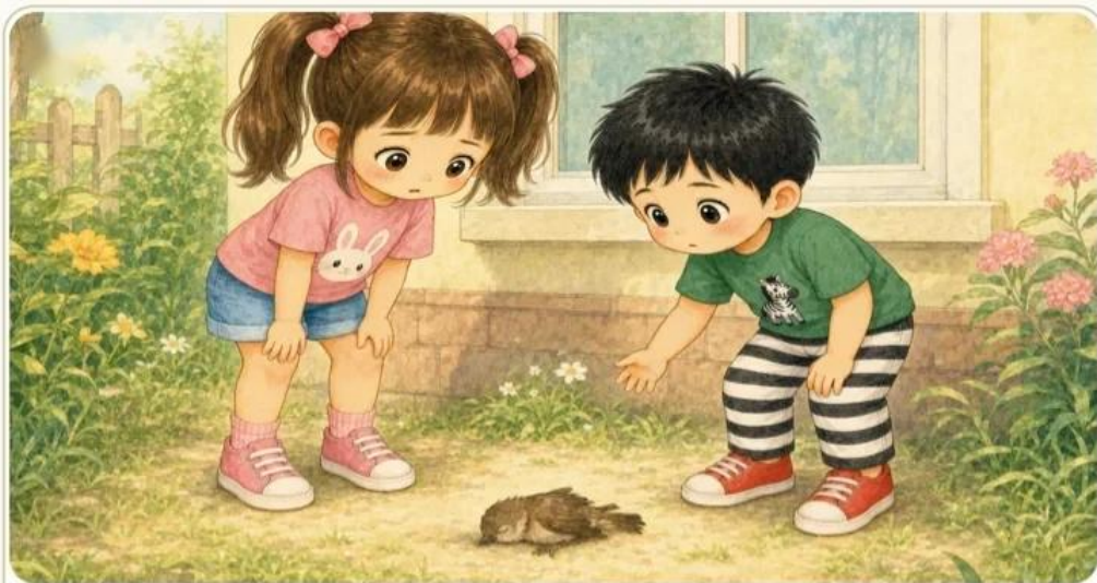
兔兔和斑斑發現受傷的小鳥。 Tutu and Ban-Ban find an injured little bird.