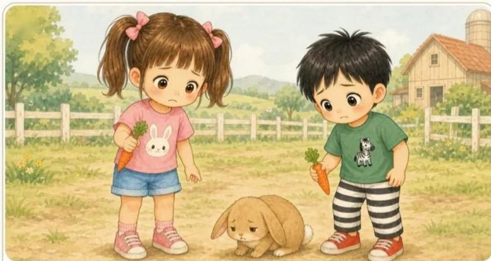
他們看到一隻沒精神的小兔子。 They see a little rabbit with no energy.