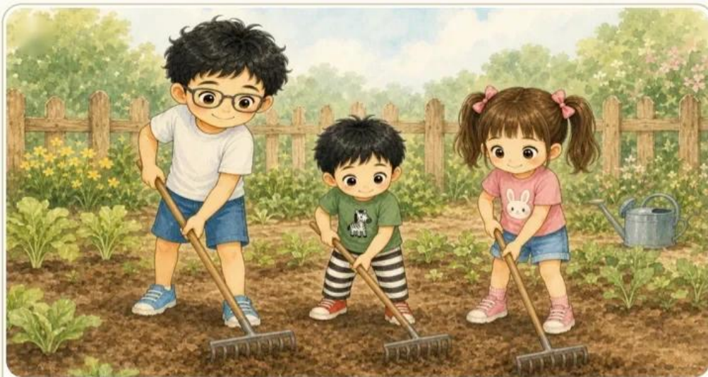
大家用耙子鬆土，準備種青菜。 Everyone rakes the soil to get ready to plant.