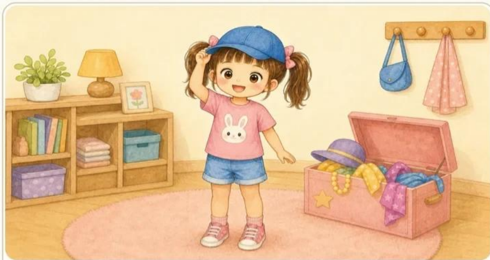
找到帽子了！ Found a hat!