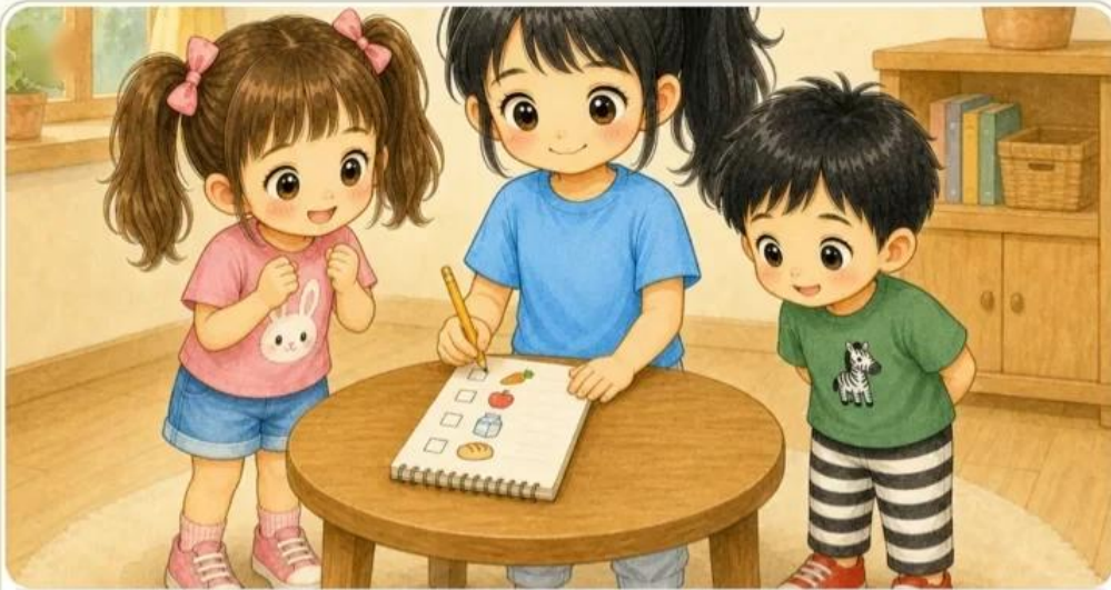
在家寫好購物清單。 At home, they write a shopping list.