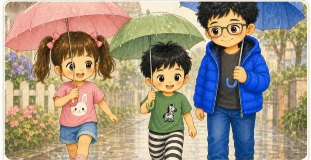
大家一起撐雨傘回家。 Everyone walks home together under umbrellas.