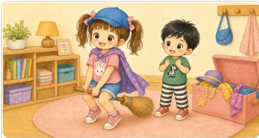
兔兔變成小女巫了！ Tutu becomes a little witch!