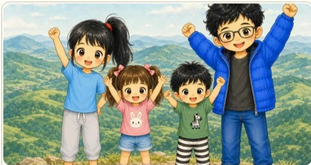
終於到山頂，風景好美！ They reach the top — the view is beautiful!