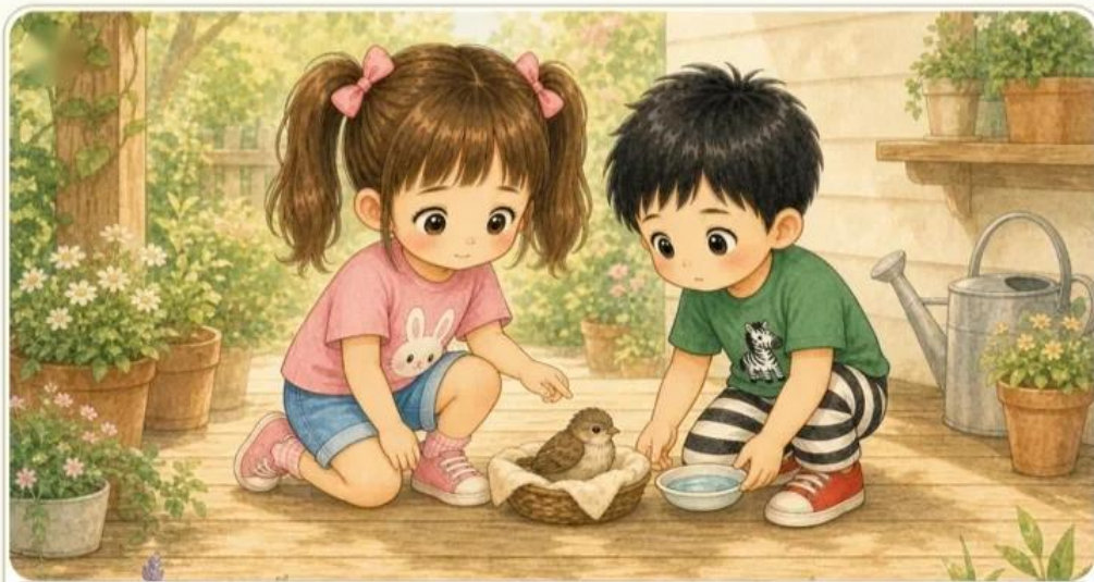
他們讓小鳥休息，給牠喝水。 They let the bird rest and give it some water.