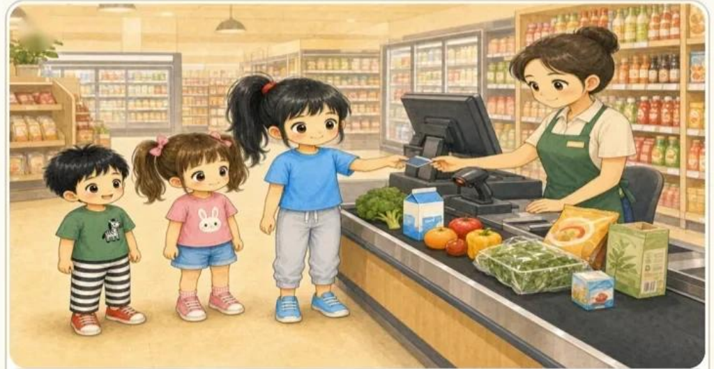
到櫃台結帳付錢。 They pay at the checkout counter.