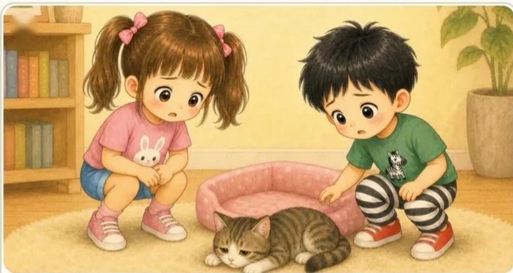
小貓咪沒精神，好像生病了。 The kitten looks tired — it seems sick.