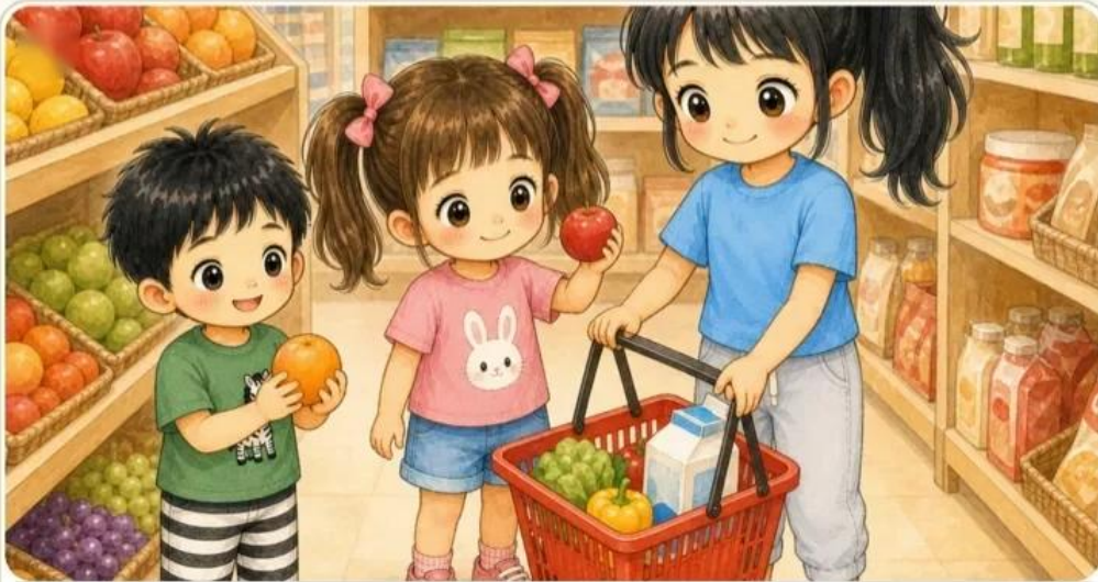
在商店挑選要買的東西。 They pick out things to buy at the store.