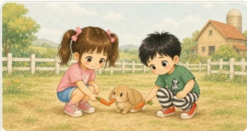
斑斑和兔兔餵小兔子吃紅蘿蔔。 Ban-Ban and Tutu feed the rabbit carrots.