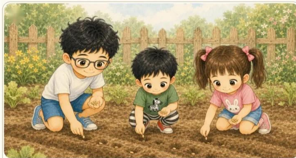
把種子放進泥土裡。 They put the seeds into the soil.